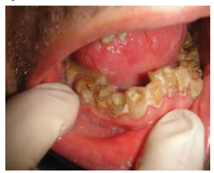
Figure 3. Post-intervention debris

Documentation recorded in both the daily flow sheets and the RAI-MDS contradicted onsite oral assessments and underreported dental/oral problems. Staff explained that daily flow sheet entries are frequently used to complete the RAI-MDS for daily oral care. This may explain why such large discrepancies were found in comparing oral assessments with both corresponding flow sheet documentation and RAI-MDS data. For example, onsite oral assessments 1 year following the intervention showed that only 29% of residents had no debris and received daily mouth care. Daily flow sheets reported that 73%