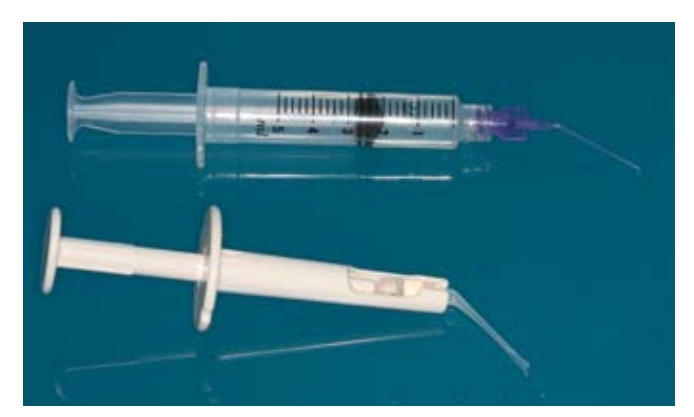
Figure 1. Devices for introduction of the CHX gel (upper) and HA gel (lower).